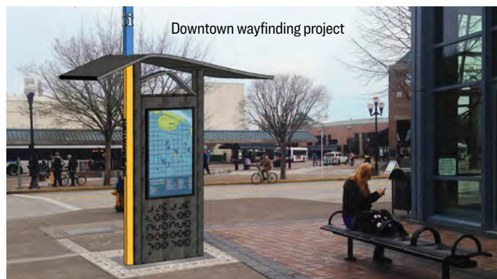
Downtown wayfinding project