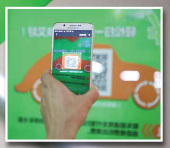
Patrons can use their smartphones to scan QR codes in the garage and get instant information.

STHE WORLD'S LARGEST CAR MARKET, China is making significant moves to spur the growth of electric vehicles (EVs). The Chinese government announced this past fall that it will be moving toward banning the sale and production of fossil fuel vehicles. China is not the first to threaten the future of the combustion engine. Policy and industry changes like China's are an indicator that the way companies and governments deal with transportation is entering a new era.