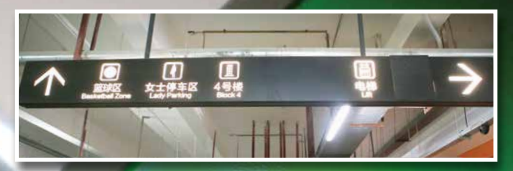
Directional signs use both language and graphics to help drivers and pedestrians navigate between their cars and their above-ground destinations.

Green lighting both illuminates the garage and provides easy wayfinding cues to help drivers find their way around.